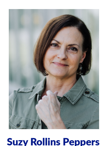
OCT 17 & 18, 2018 Building instructional practices that create energized, autonomous, focused learners.