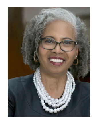
Gloria Ladson-Billings AUG 15 & 16, 2018 Using culturally-relevant pedagogy to reframe gaps, engage, and empower all students for improved learning.

How do you create a true learning partnership between educators and students? How do you harness student voice, engagement, and efficacy to empower every learner to achieve at higher levels? now for WOW 2018-19! Your school-based team of 4-12 educators will work closely with nationallyrecognized education leaders to develop and implement clear action steps that are: 1) tailored to meet your local needs; 2) maximize Educator Effectiveness as a process of continuous improvement; and 3) integrate with your ongoing school or district improvement strategies. Registration is FREE!