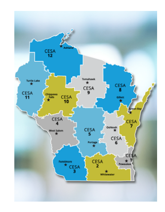
APR 3 & 4, 2019 Putting it into practice: CESA-facilitated teamwork time, problem-solving, & planning to enact team goals.